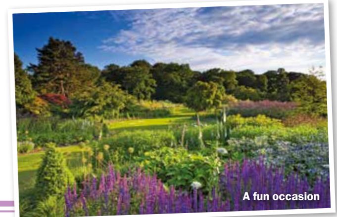
A fun occasion

◆ Enjoy summer evenings and take a picnic to RHS Garden Harlow Carr near Harrogate, where there's live music every Thursday evening throughout July. Entry to this 68-acre valley and stream-side garden is free to RHS members, or it costs £5 after 5pm for non-members. www.rhs.org.uk